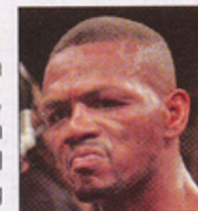
Campbell: Declares bankruptcy